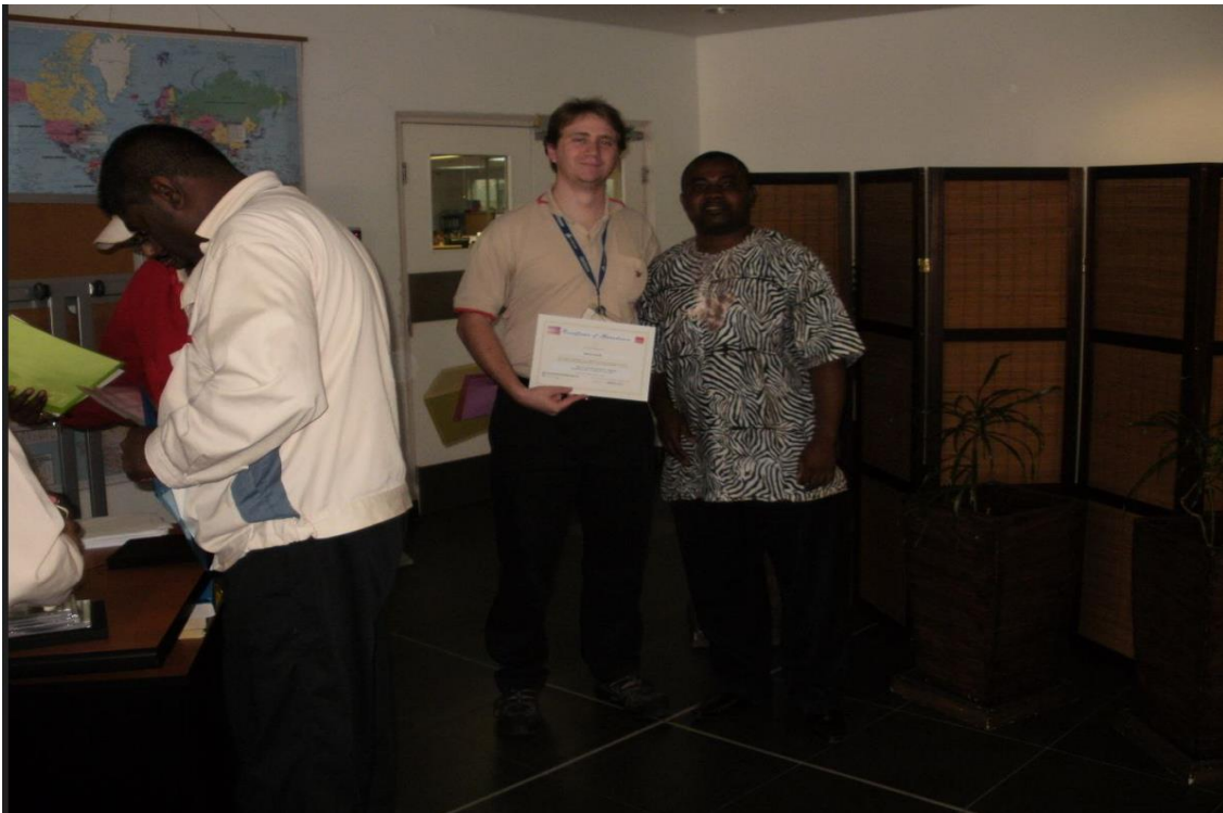
Toyota Boshoku South Africa 201107 CWORKS CMMS end-user training-Durban