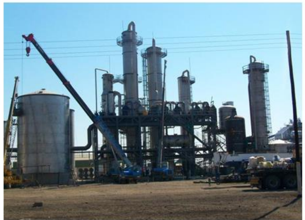
Green Fuel-Chisumbanje Plant 202306