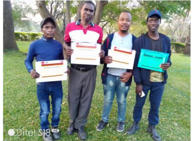
CWORKS CMMS Implementation trained employees.