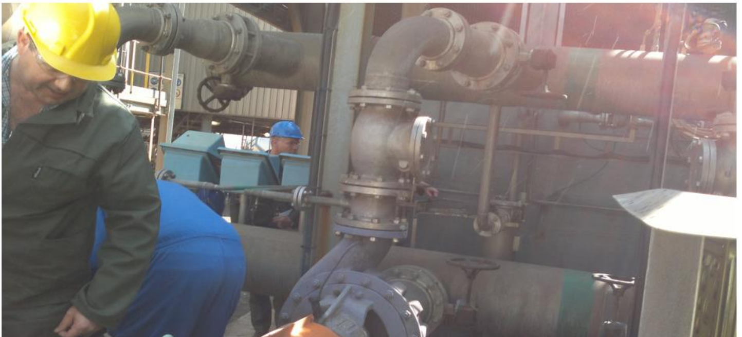
IMPALA PLATINUM-SPRINGS 201208 UNIDO PSO Energy Assessment