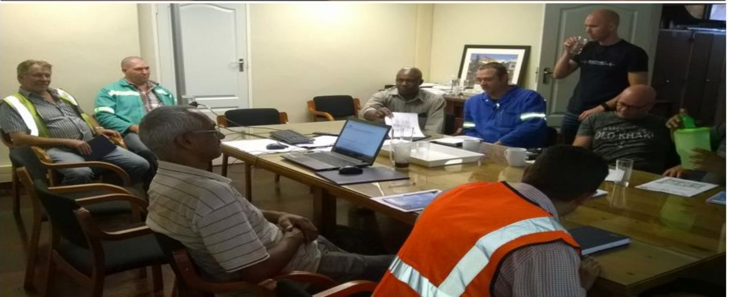
SA METAL GROUP 201702 CWSQL CMMS Train the Trainer Workshop